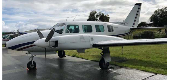
Piper Navajo PA30

In September, these aircraft are to be “redistributed” to new owners – such as you (or someone you know)!